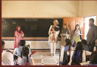
European Union Mission visit Government Girls High School Gizri, Karachi