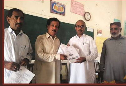
School Consolidation Ceremony Government Boys Primary School Makli, Thatta