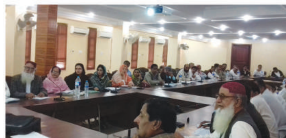
SSB Training Session (District Badin)