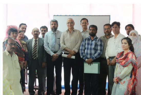
Training Session on School Consolidation Policy implementation

Government Girls High School, Thano Bola Khan Government Girls Higher Secondary School, Sindh University Colony